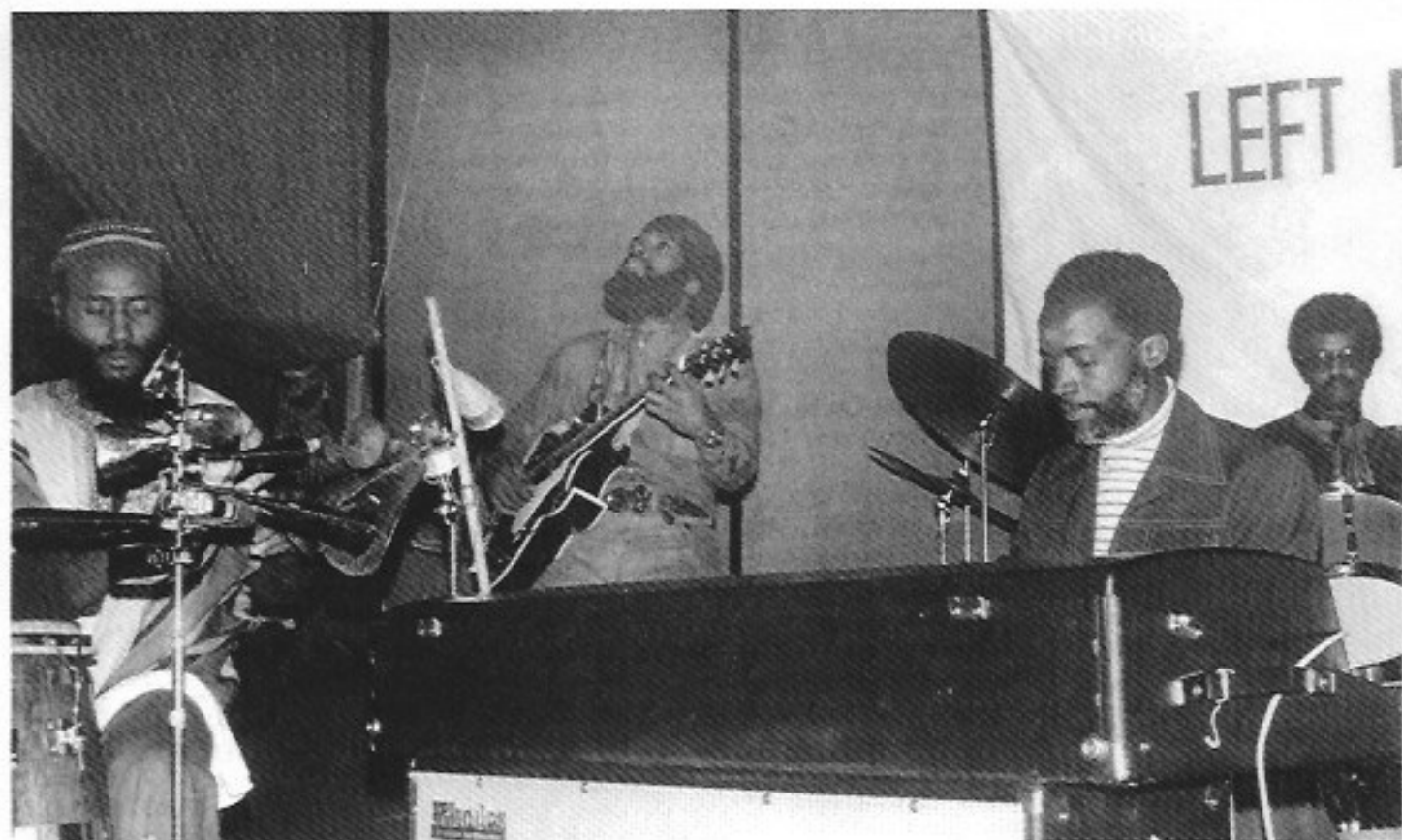
Ahmad Jamal "had a few surprises in store for the audience" on 11-9-75.